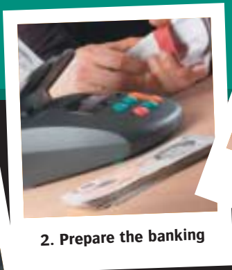
2. Prepare the banking