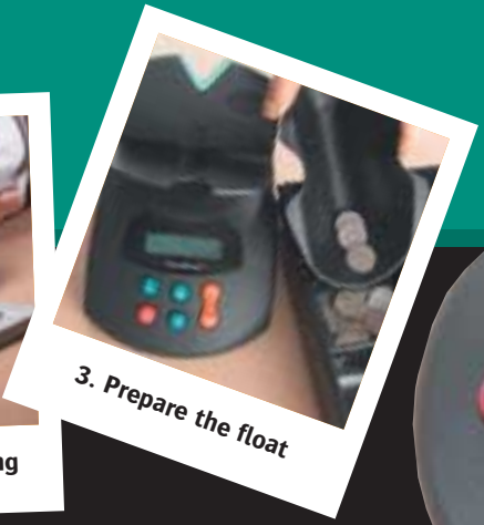
3. Prepare the float